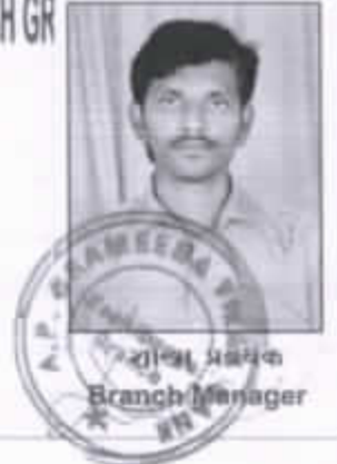
బ్రాంచ్ మేనేజర్ Branch Manager